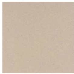
1080 Adobe Buff