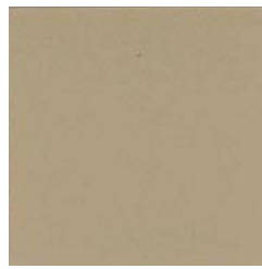
1070 Sandy Buff