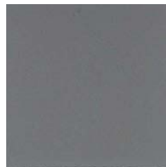
600 Light Gray