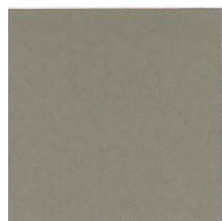
1040 Weathered Sage