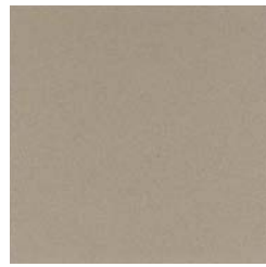
250 Oyster White