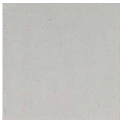
625 Dover Blue