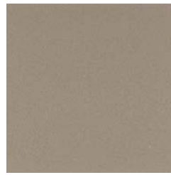
1090 Sun Buff