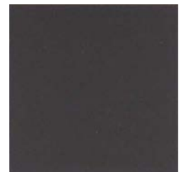
100 Dark Gray