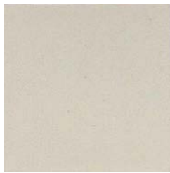
1030 Ash White